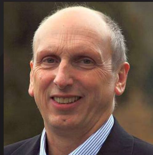
Frank Lee Institute for Collaborative Working