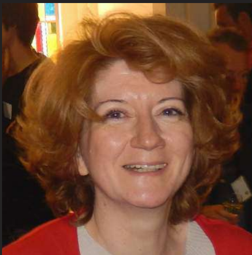
Elma Durmisevic Circular Construction in Regenerative Cities