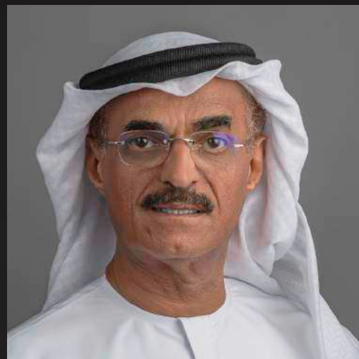
H.E. Dr. Abdullah Belhaif Al Nuaimi

Former UAE Minister of Climate Change and Environment | Visiting Lecturer | Youth Mentor