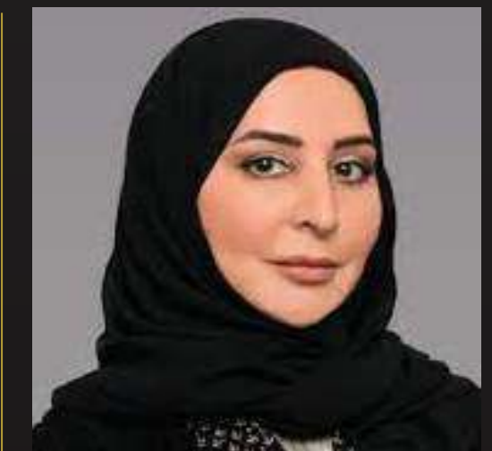
Eng Naseibah Almarzooqi UAE Ministry of Energy and Infrastructure